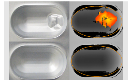
Photo and evaluation view of blister inspection