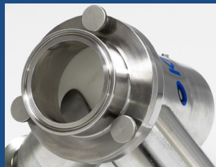
Various Inlet adapter sizes available