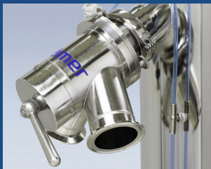
Assembling without any tools and additional holder