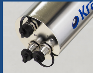
Optional: Connections for filling level- and Jam sensors